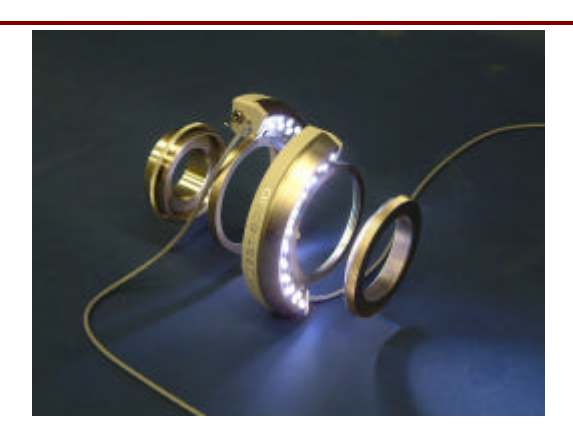
Product Number including Power Supply